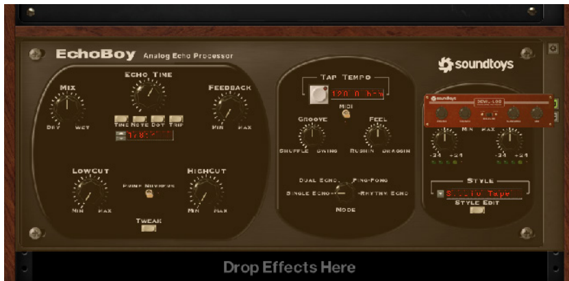
Figure 5: Replacing a Rack item

You can also swap out rack pieces where the newly inserted piece of gear will take the place of an existing piece and remove it from the rack. To do this, simply drag your new item to the Rack and center it over the piece of gear you would like to replace. You will see that the entire effect to be replaced will be highlighted yellow (as shown in Figure 5 below).