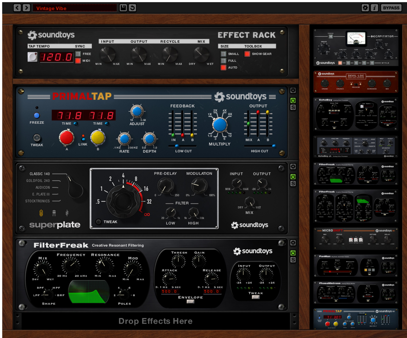
Figure 1: Soundtoys Effect Rack loaded up and ready to go!