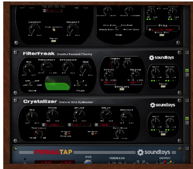
Figure 3: Soundtoys Effect Rack's Rack - Loaded!