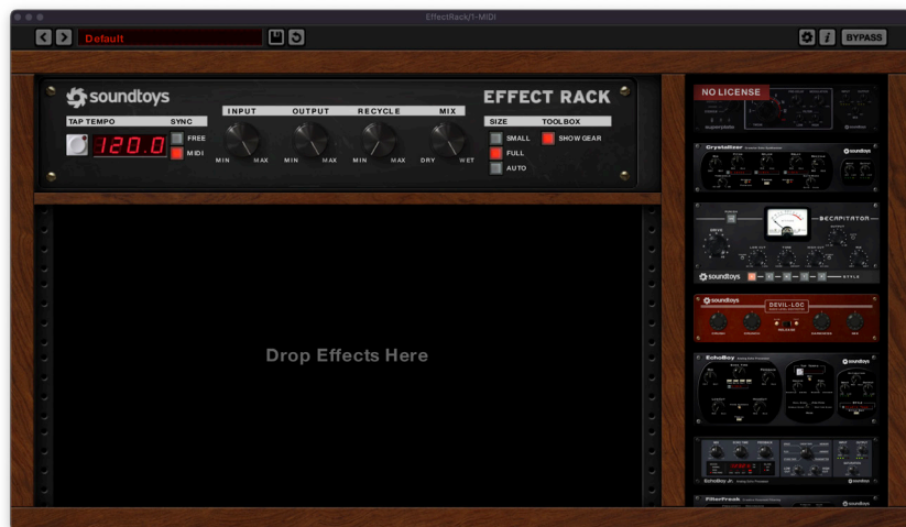
Figure 6: Unlicensed SuperPlate in Effect Rack

If you have not purchased a license for SuperPlate, you will still have access to SuperPlate's presets in Effect Rack, but you will not be able to edit the parameters. You will also notice that SuperPlate is grayed out on the right-hand side of the Rack, and displays a red banner that says 'NO LICENSE' like on the image below: