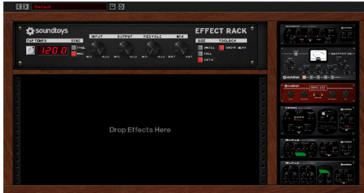
Figure 2: Empty Effect Rack with Gear List displayed