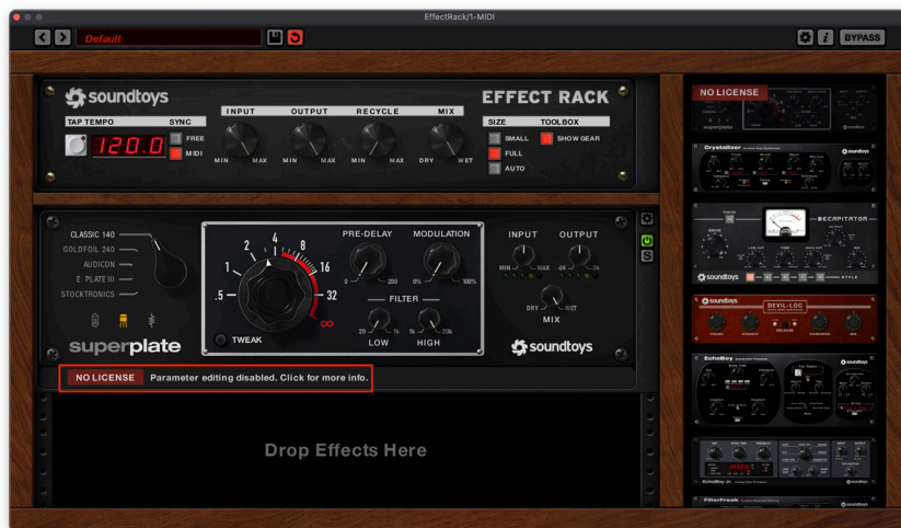
Figure 8 : SuperPlate NO LICENSE notification

From here you can either click 'Learn More' to be taken to the website to purchase SuperPlate, or the green 'Activate' button if you have already purchased SuperPlate but have not activated it.