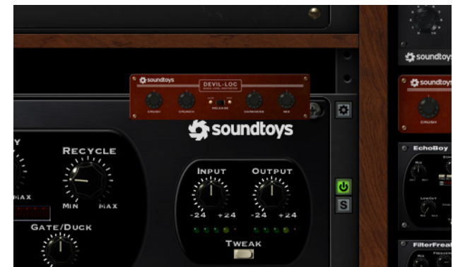
Figure 4: Inserting above an existing Rack item