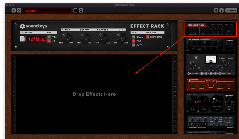
Figure 7: Drag unlicensed SuperPlate to the main Rack window

If you wish to purchase and / or activate SuperPlate from Effect Rack, simply drag SuperPlate from the plug-in list on the right over to the main Rack window on the left.